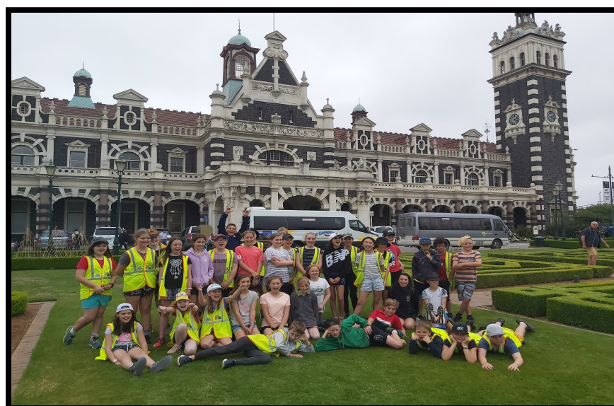
Our Year 6 children on Camp last week standing in front of the Dunedin Railway Station!